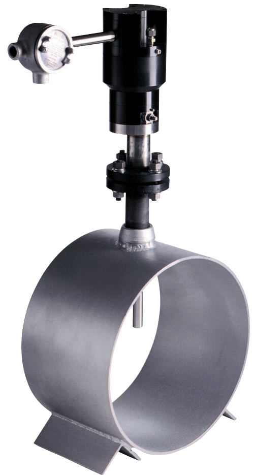
Advanced Sulfur Reduction (ASR) Sampling Probe

AMETEK Process Instrument's ASR probe is an integral component of the 900 Air Demand Analyzer. Whatever the requirement at the sample point, AMETEK Process Instruments can supply a trouble-free engineered solution.