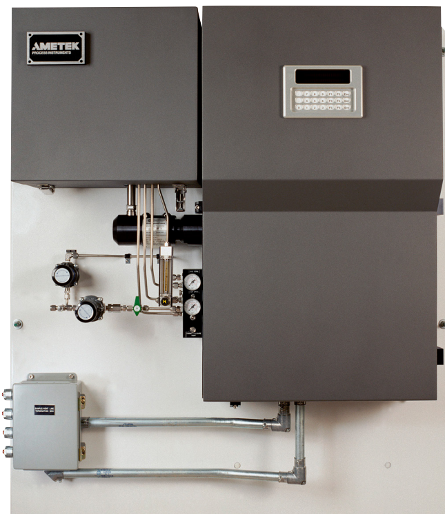
Model 900 Air Demand Analyzer